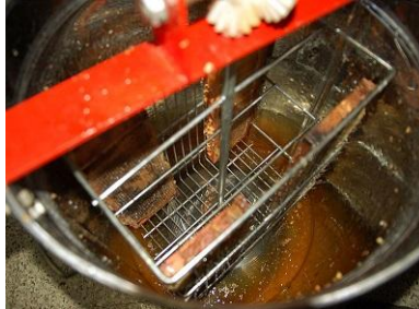
table. The infibiled the process, we had to clean th

In the fall, comes the best part. You get to harvest the honey. It can be done by hand or with some modern equipment. The first year, we did it by hand. We took the frames out – one at a time. We cut the comb and squeezed the honey out. Next we had to warm the mixture ever so slightly so that it doesn't get too hot. Too much heat will destroy the health benefits of honey. The heat will divide the honey and the wax. But what a mess! We had sticky goo on the floor, on the counters and on the table. After we finished the process, we had to clean the kitchen.